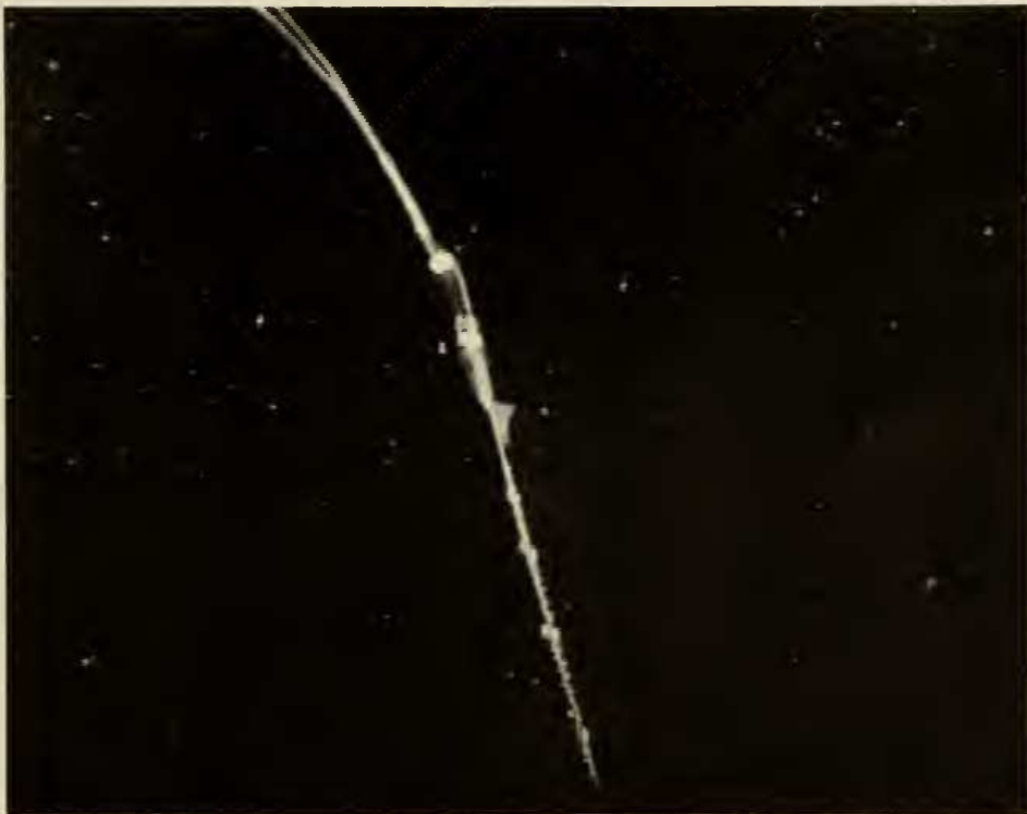
Fig. 3. Still frame from a videotape recorded in-situ, showing a Pacific doratopsis. The squid is oriented obliquely with the tail directed down and the arms and tentacles up.